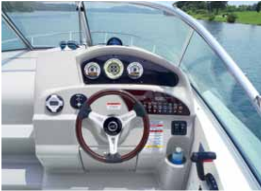
The clean and compact helm comes with standard SmartCraft® instrumentation and a convenient cup holder.

Our 240 Sundancer is easy to drive, maintain, and afford while also offering all the comforts that have made our industry-leading express series so popular. This capable cruiser offers a V-berth and mid-cabin, as well as a galley and head. Cruising-friendly optional upgrades include air conditioning, shore power, a water heater, and more.