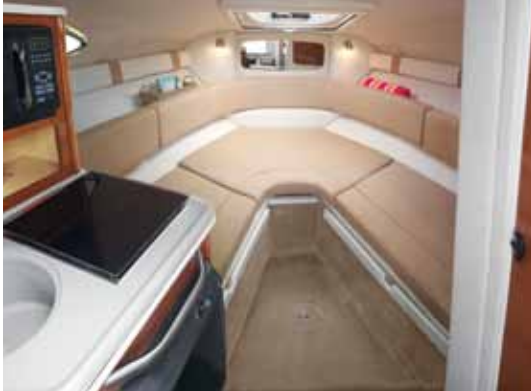
Wraparound seating in the V-berth converts to a bed with side-shelf storage built in. A mid-berth is aft.