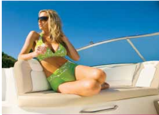
A portside lounge allows passengers to really stretch out. Wide, molded steps lead to the foredeck.