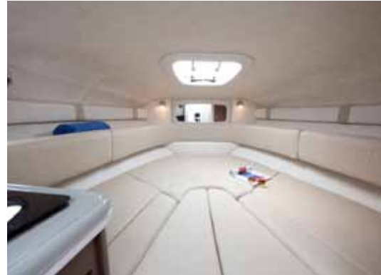
Shown with optional filler cushions.