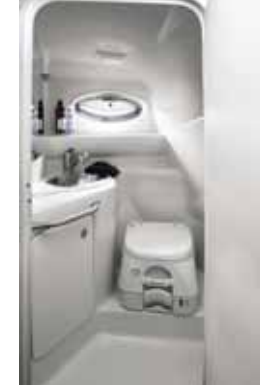
Full fiberglass head with portable toilet standard.