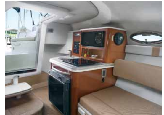
The galley's molded fiberglass counter incorporates a sink, faucet, and single-burner stove.